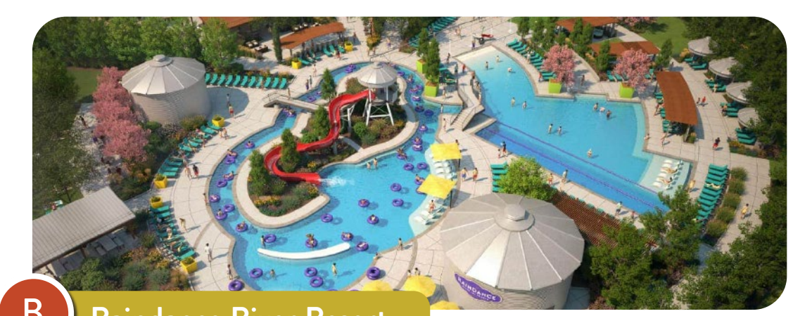
B Raindance River Resort