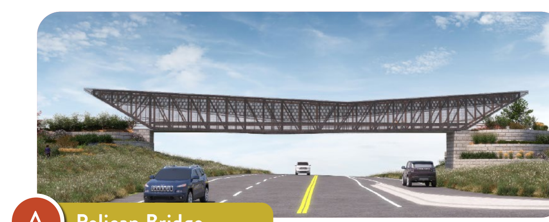
A Pelican Bridge