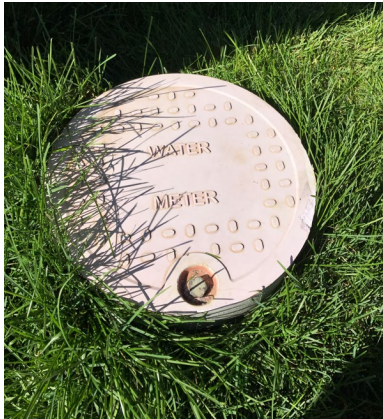
Non-potable Water Meter located in meter pit